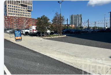
3025 JFK Blvd. - Schuylkill Yards West Tower Garage ★★★★★ (130) 🚶 <1 min (69 ft)