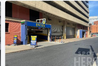
3387 Ludlow St. (3330 Market St.) - Drexel Garage ★★★★★ (20) 🚶 7 min (0.3 mi)