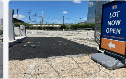
3003 JFK Blvd. - Lot ★★★★★ (1,174) 🚶 2 min (0.1 mi)