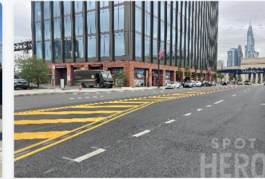
3051 John F Kennedy Blvd. - Lot ★★★★★ (23) 🚶 <1 min (177 ft)